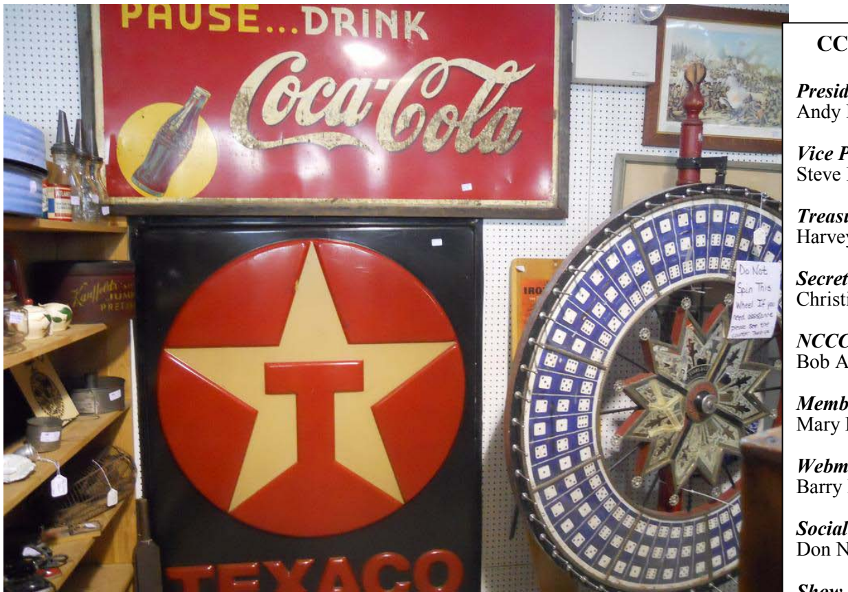
Some Stuff for Sale at the Old Sled Works

The official newsletter of the Corvette Club of Northern Delaware - March 2011