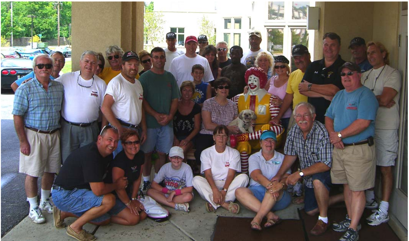
Charitable Member's of CCND at the Ronald McDonald House