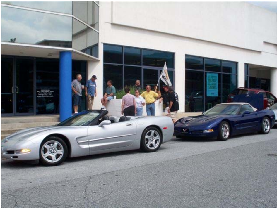
Gathering at Diver Chevrolet