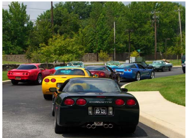
Just some of the cars and wonderful people who took time for the worthy event