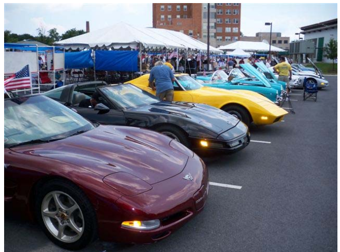
Just some of the Club Cars supporting the event