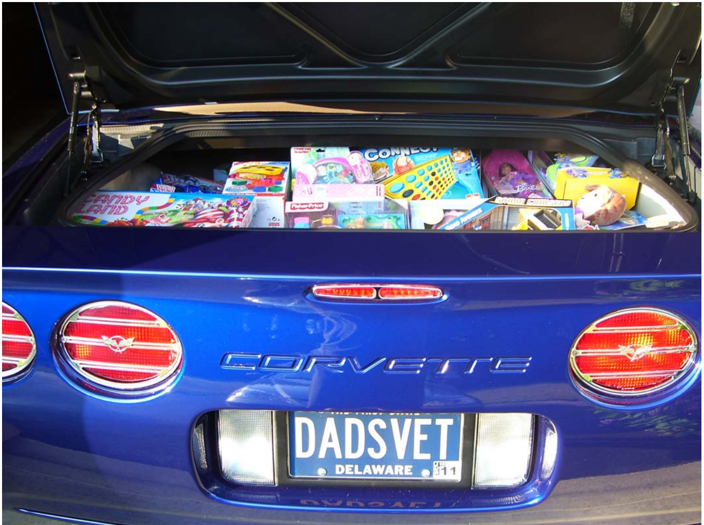
Just some of the total 200 or so toys donated by everyone for this worthy cause – Thank you all!!!