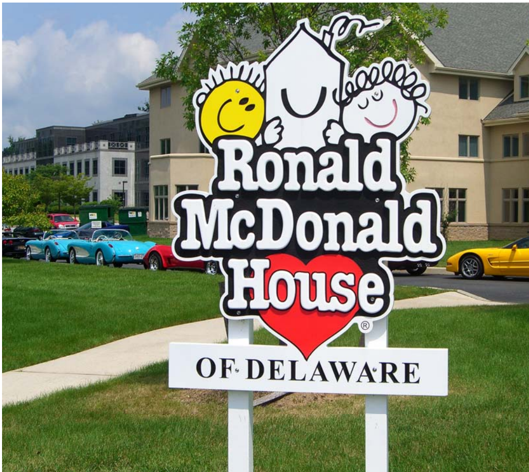
Ronald McDonald House Toy Drive

The official newsletter of the Corvette Club of Northern Delaware September 2009