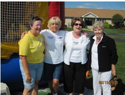
Some of the ladies of CCND who attended enjoying the moon bounce.