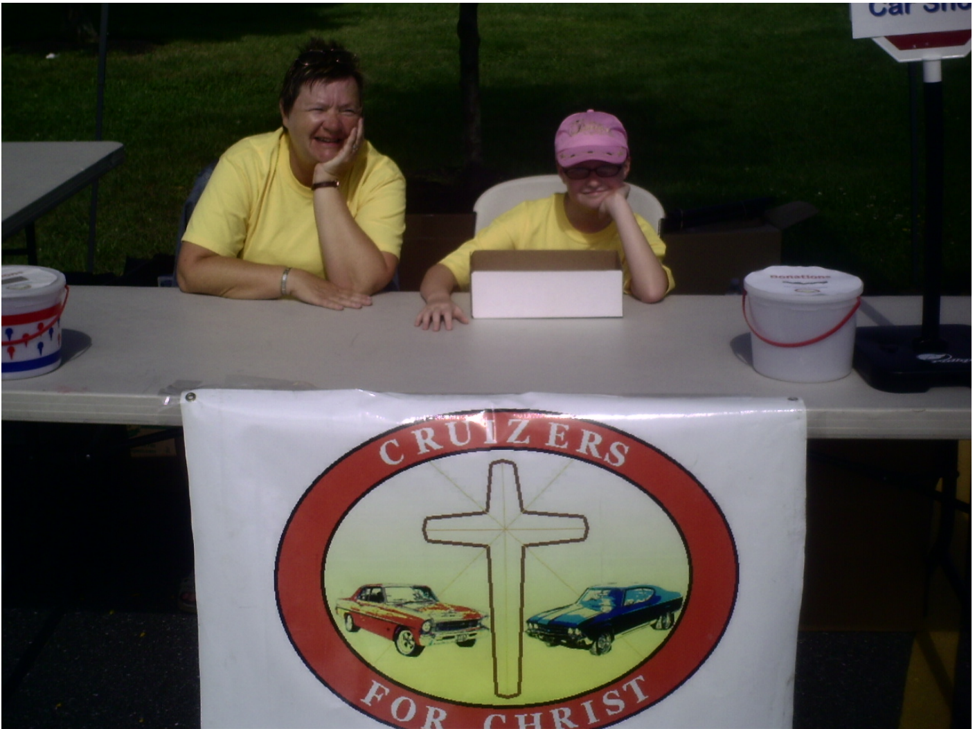
Waiting for Registration to start – Over 100 cars attend the event