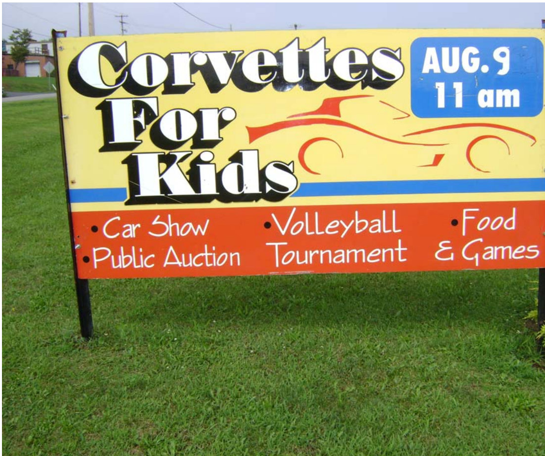
Corvettes for Kids

The official newsletter of the Corvette Club of Northern Delaware October 2009