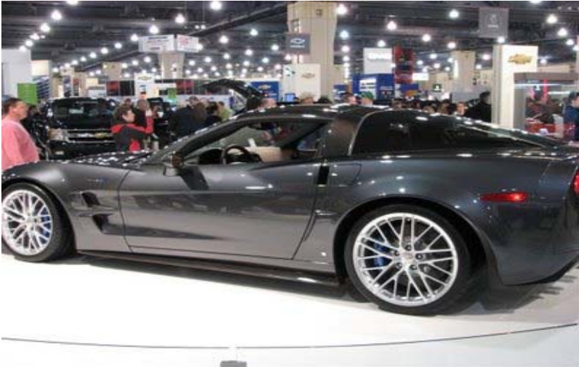
The ZR1 From the Philadelphia International Auto Show

The official newsletter of the Corvette Club of Northern Delaware - March 2009