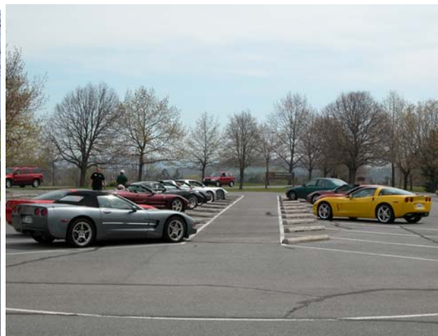
Just one of the scenic stops made throughout Pennsylvania