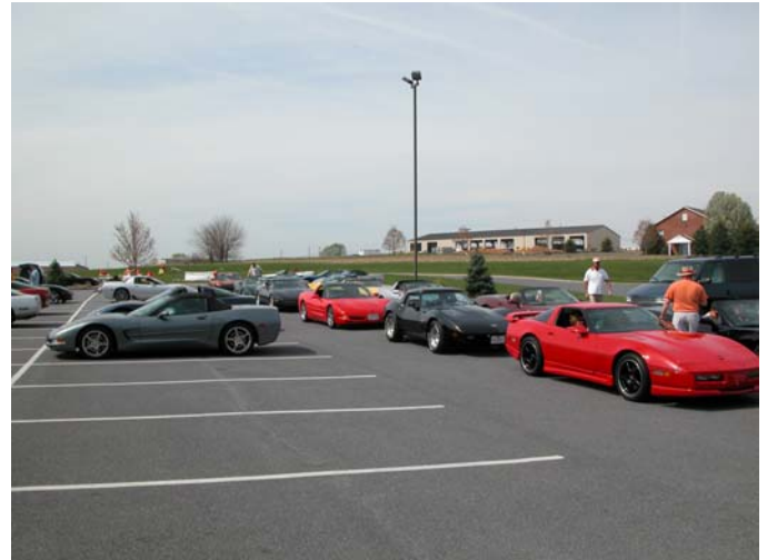
The Starting Line a Shady Maple, PA

Saturday, April 25 dawned a sunny and warm spring day– the perfect day for a nice long cruise in a Vette. Two CCND members took advantage of the great weather and the hospitality of Keystone State Corvette Club to combine cruising with support for a great cause at KSCC’s 2 nd Annual Poker Run.