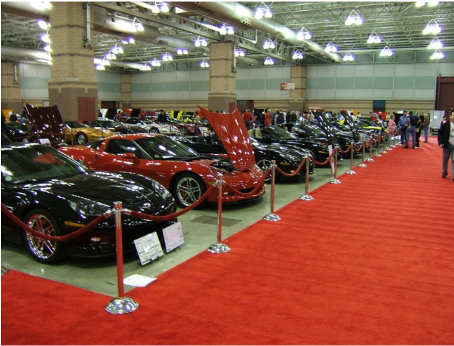
Strictly Corvettes at Atlantic City

The official newsletter of the Corvette Club of Northern Delaware June 2009