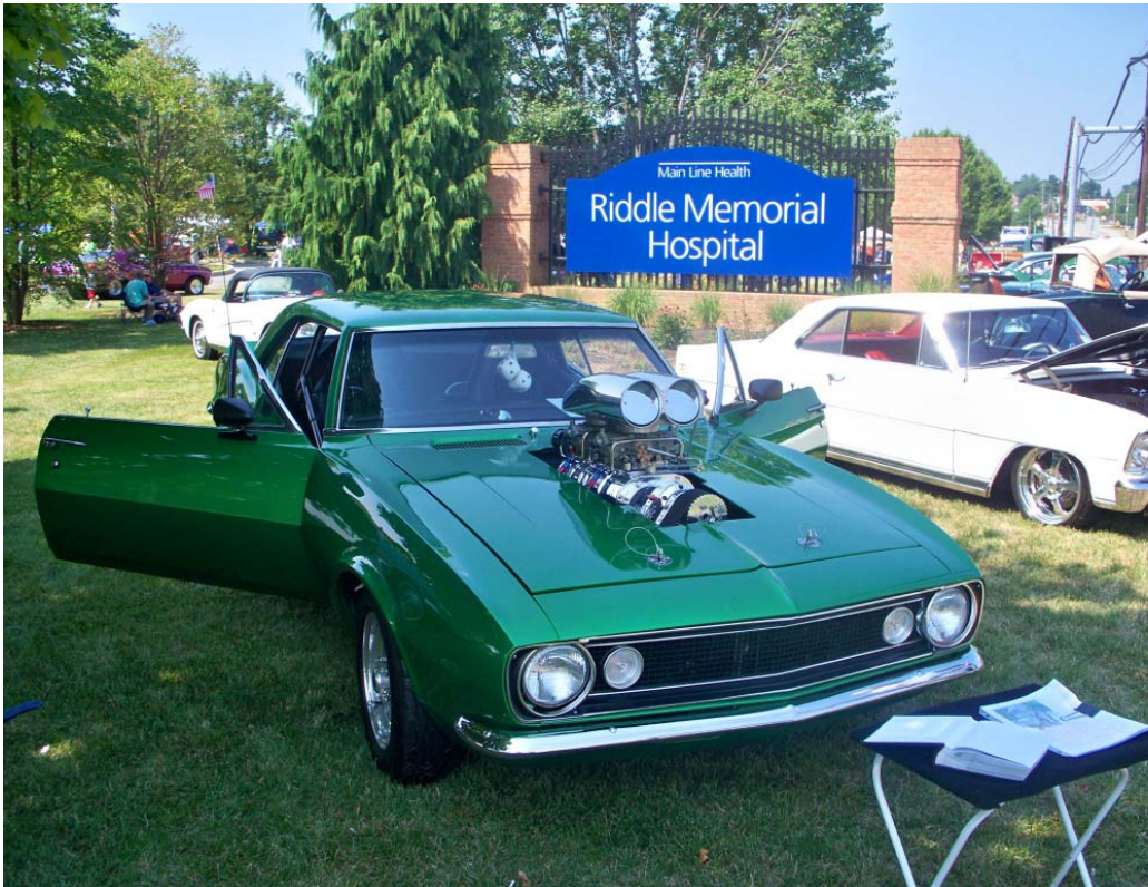
Riddle Memorial Hospital Car Show

The official newsletter of the Corvette Club of Northern Delaware August 2009