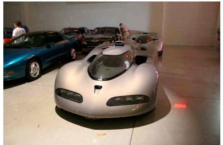
Oldsmobile concept car