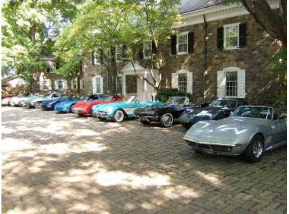
Courtyard parking at the CCND annual picnic

Corvettes for Kids Show CCND Picnic GM Heritage Center 1980 Corvette specs Humor