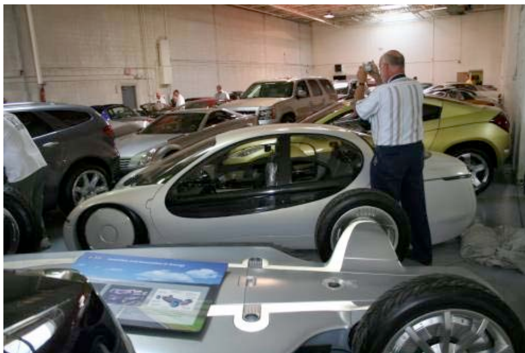
What is this??