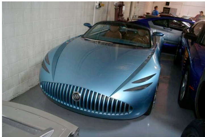
Big mouth Buick