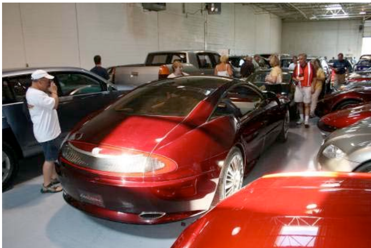
Buick concept car