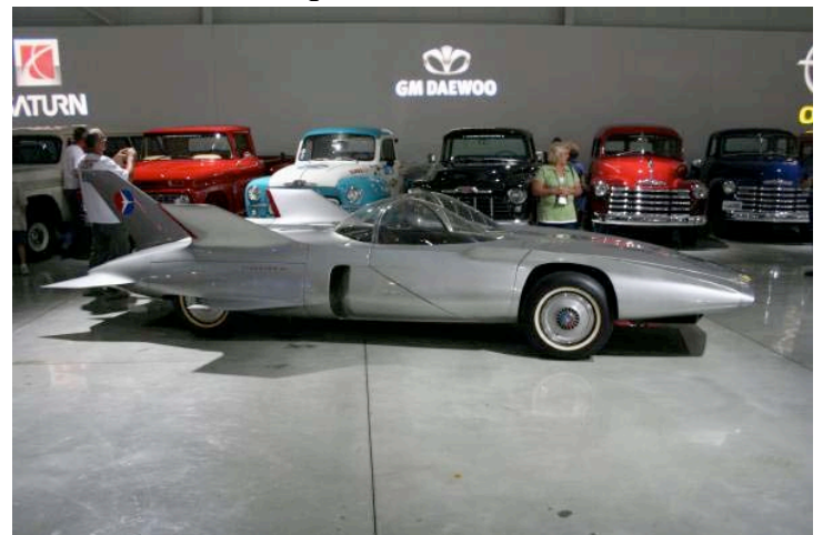
Fly Firebird concept car