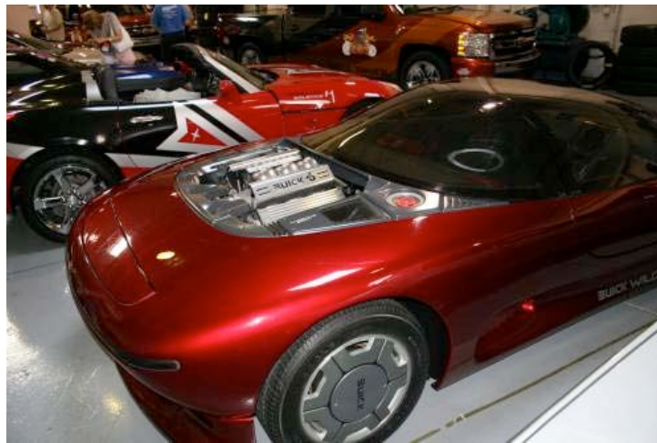
Buick concept car