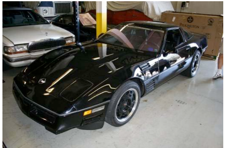
1989 ZR1 Test Mule