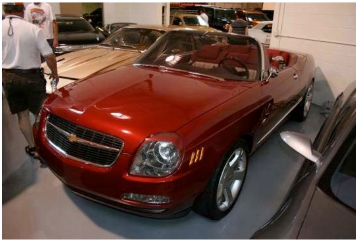
Should have made this one...