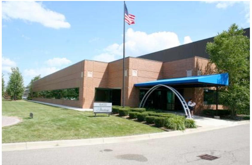
The Heritage Center

But that's only part of the story. The GM