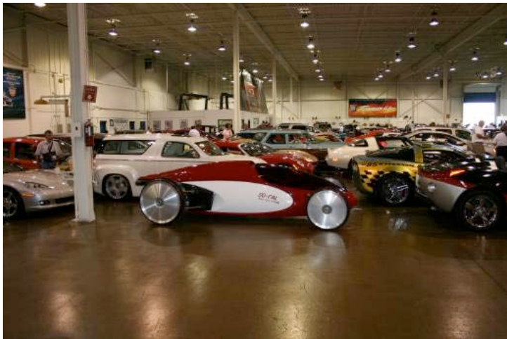
Cars, cars, & more cars